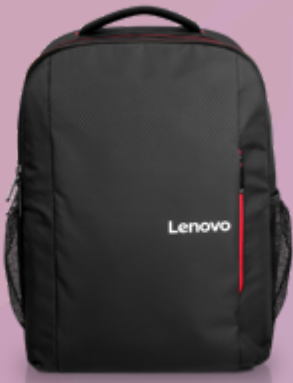
Lenovo 15.6 Laptop Everyday Backpack B510-ROW 4X41U80414

Please click here to view the full list of accessories.